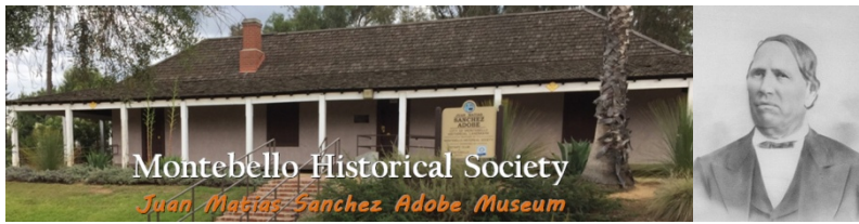
Montebello Historical Society Juan Matias Sanchez Adobe Museum